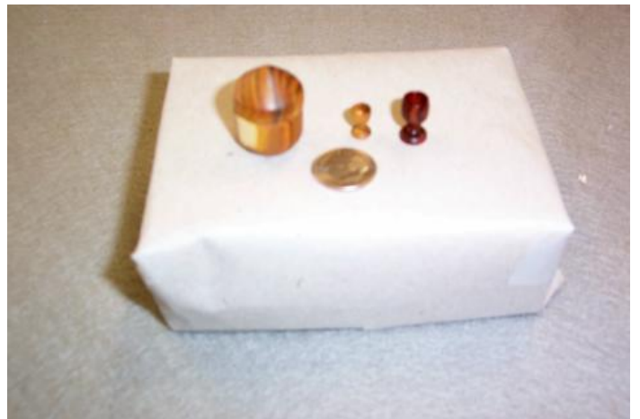
There was a miniature bowl with two goblets.