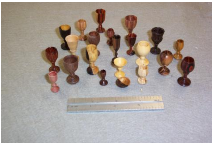
He had a whole gaggle of miniature turnings from scraps left over from pen turnings.