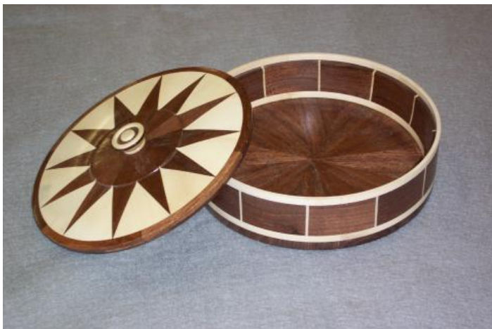
from Walnut and Holly.