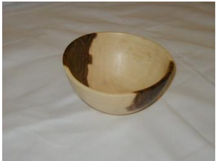
and a Walnut bowl.