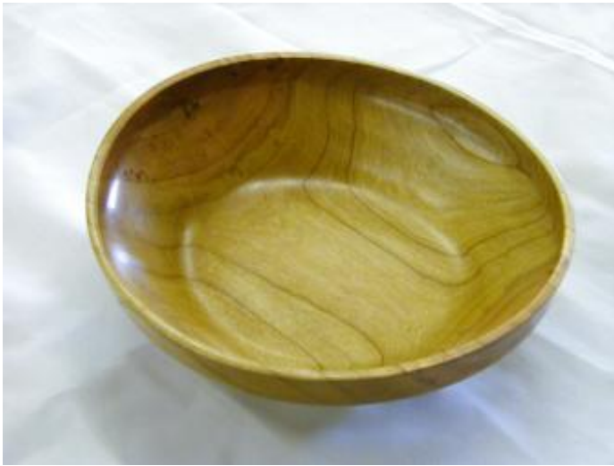
He also had an attractive shallow Cherry bowl.

This bowl was meant to be much deeper, but a serious crack developed, so the bowl needed to be cut off to exclude the crack, to prevent it from cracking further.