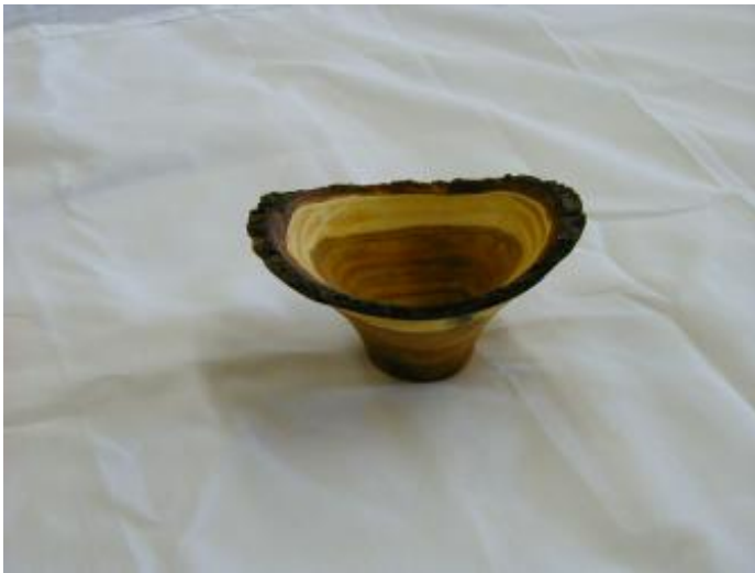
He also had a nice natural edge Peach bowl