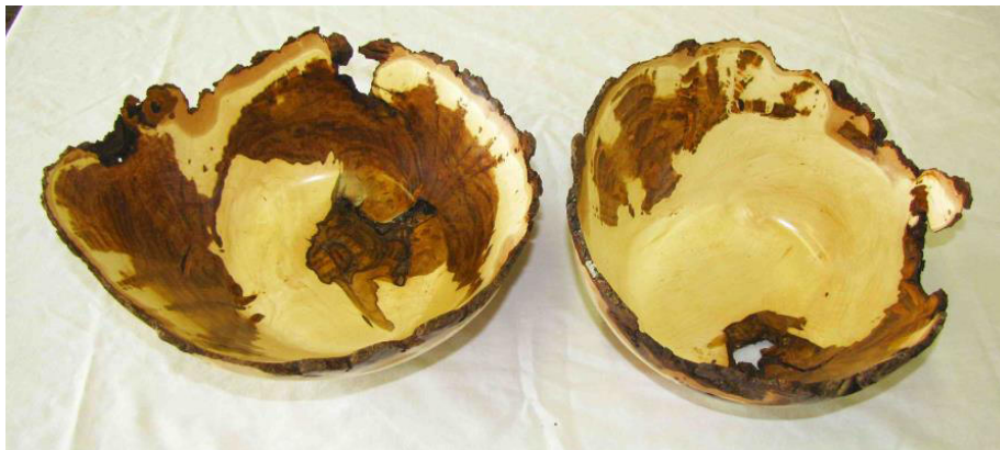
Bob Lett has two natural edge bowls from maple l