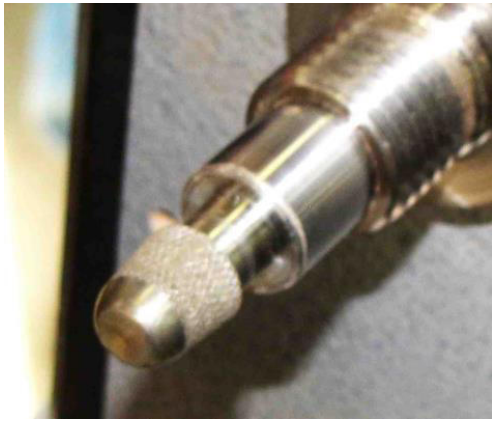
John's special jig to mount the thimble blanks.