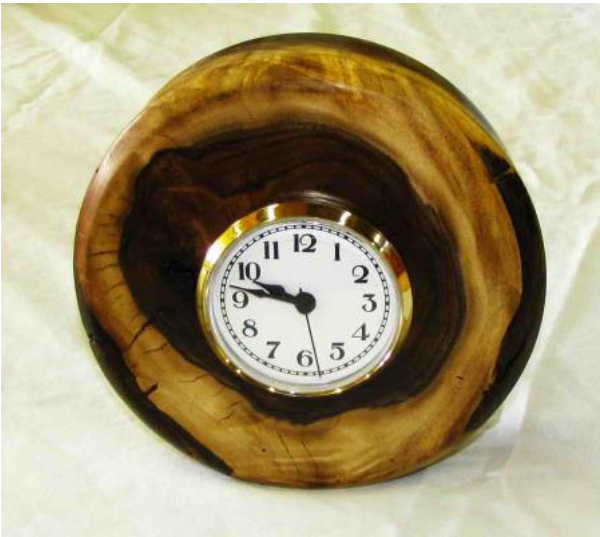
Brad Ash showed his walnut clock .