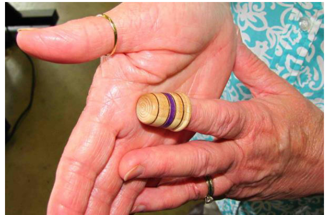
Finished product professionally modeled by one of our own.