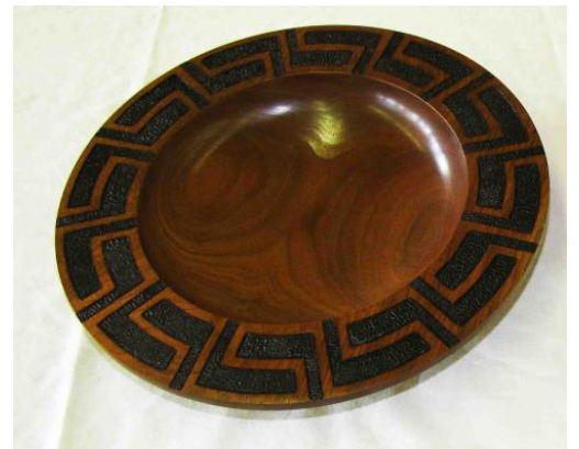
Larry Weese turned a walnut bowl complete with embellishments and a lacy pierced maple bowl.