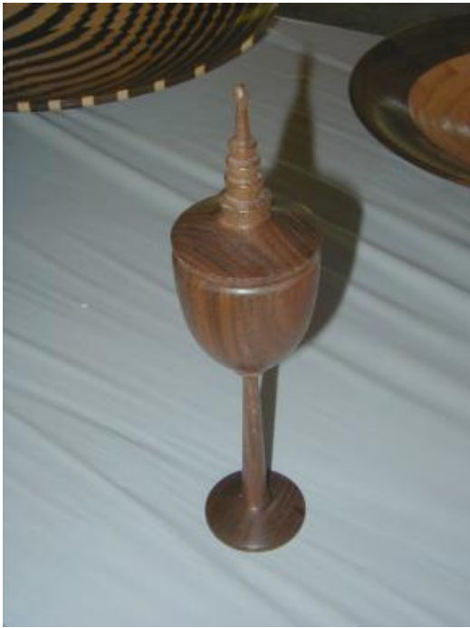
and a beautiful chalice turned from Cherry.