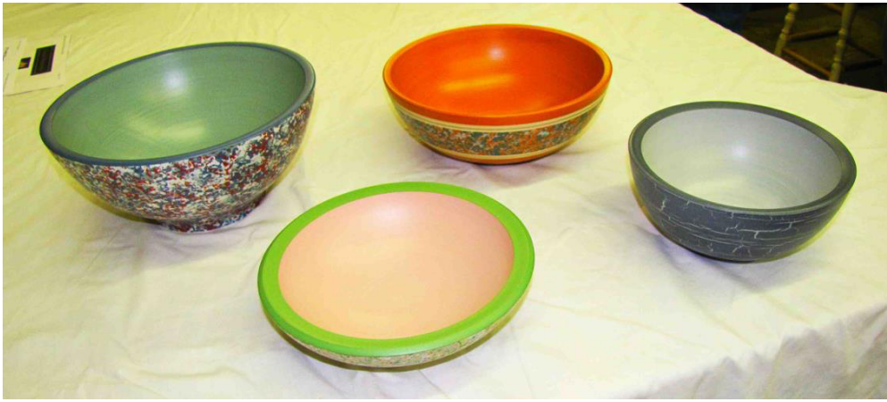
his Americana style poplar bowls with milk paint dabbed on with a sponge and crinkle paint.