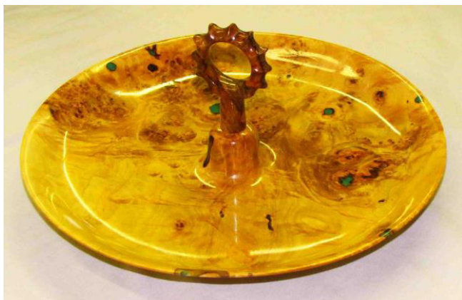
Warnie Lore made a candy platter from maple burl with a maple handle.