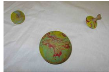
Ervin Jones showed up with a mimosa bowl and a spalted magnolia bowl.