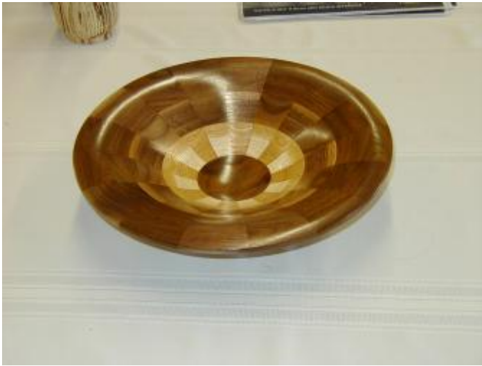
There was also a very nice segmented dish.