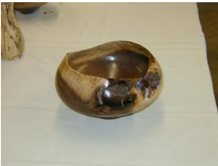
and an attractive large Walnut bowl.