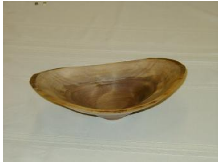
Bill McKay showed us a nice shallow Walnut bowl