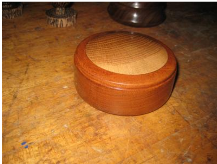
and a couple of wonderful lidded boxes – one from Mahogany with a spaulted Oak lid insert,