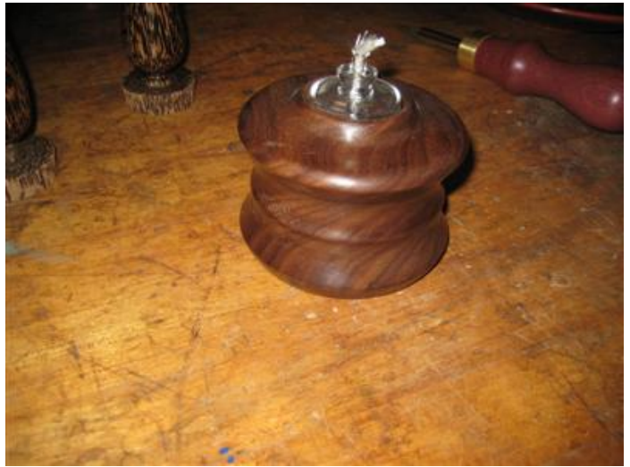
Dave Jones brought in a nice lamp, a spaulted Maple note holder,