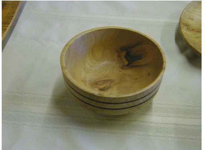
U K Dawson brought in some items to show, but too late for Show & Tell. He had turned them from spaulted Beech and Cherry.