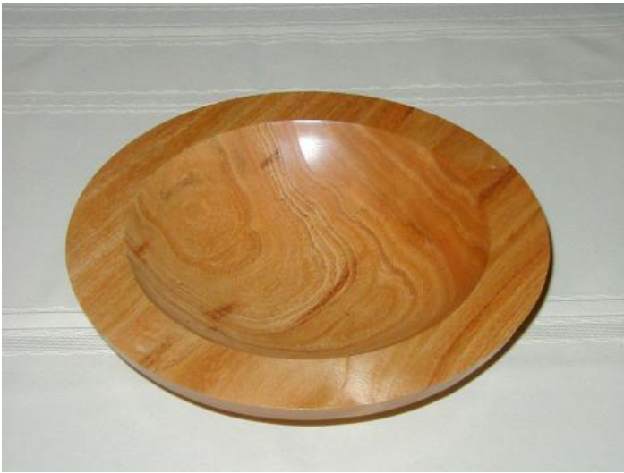
and a very nice shallow bowl turned from Coffee Tree.