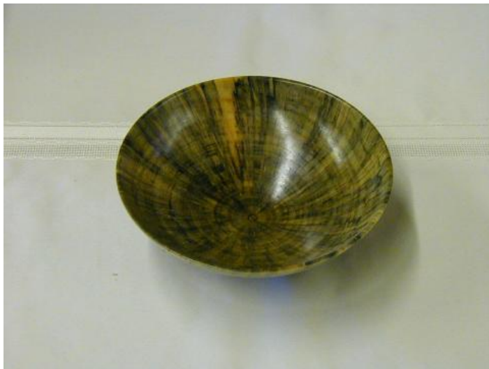
and the other without.