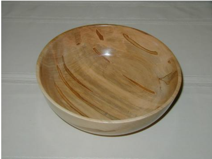
a nice Ambrosia Maple bowl.