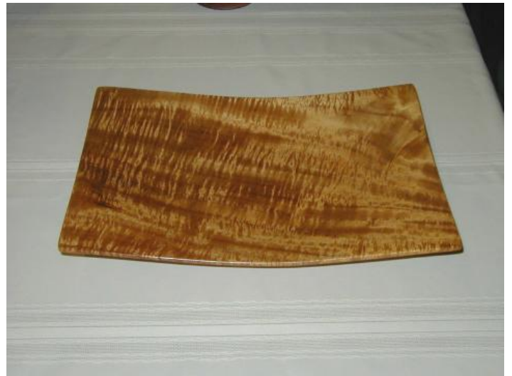
of various shapes