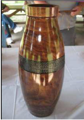
one of his large vases.