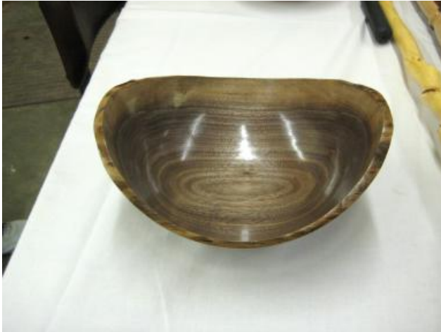
and a nice natural edge spalted Walnut bowl.