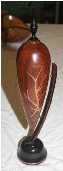
He also has a sculptural form from Tambita, African blackwood, and Ebony that utilized copper inlay.